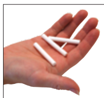
Pump Filters SP-PF-1