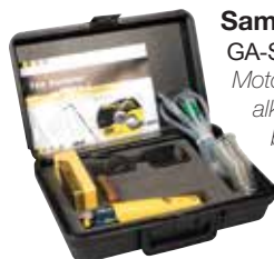
SamplerPak with Battery Kit GA-SPAK-NA Motorized sampling pump kit with alkaline batteries, rechargeable batteries and battery charger