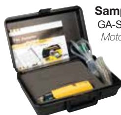
SamplerPak GA-SPAK Motorized sampling pump kit

Note: Please refer to the instrument's documentation (shipped with the product or available at www.gasmonitors.com ) for complete instructions on common service procedures. Improper servicing or maintenance may affect warranty eligibility. Honeywell assumes no liability for damages resulting from improper servicing or maintenance.