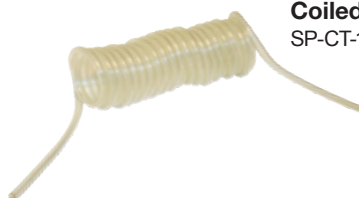
Coiled Hose SP-CT-1