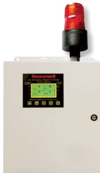
Optional Painted Carbon Steel Enclosure available for HA-20 & HA-40