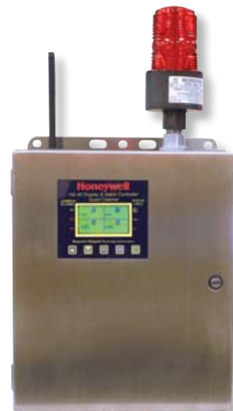
Optional Stainless Steel Enclosure available for HA-20 & HA-40