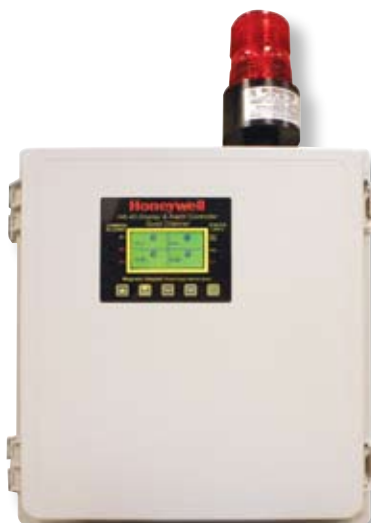
Standard Polycarbonate Enclosure available for HA-20 & HA-40

Other HA-40 options include an RS-485 Modbus slave port that allows up to 128 HA-40's to be multi-dropped onto a single data highway for interrogation by another Modbus master; choice of six programmable 5 amp SPDT discrete alarm relays; 4-20mA outputs; light stacks; and audible enunciators. HA-20 options include 5 amp SPDT discrete alarm relays per channel; 4-20mA outputs; light stacks; and audible annunciators.