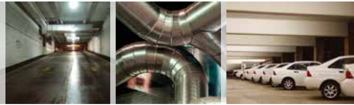
Figure 1 – Typical carbon monoxide monitoring system for a three level parking structure