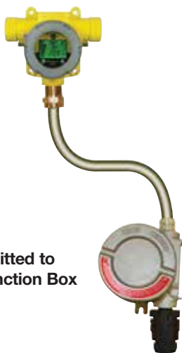
Sensor Fitted to Remote Junction Box