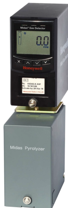
Midas Gas Detector with Midas Pyrolyzer