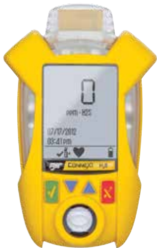
ConneX1 Gas Detector (H 2 S)

CNX1-H1-Y-NA ConneX1 wireless single gas detector for hydrogen sulfide