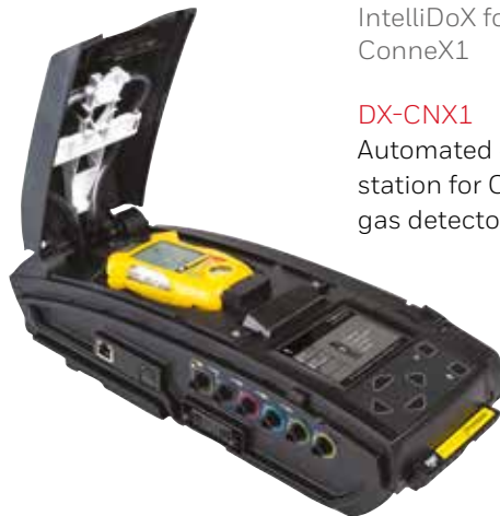
IntelliDoX for ConneX1

M031-4111-200 MicroRAE wireless 4-gas monitor