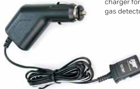
Vehicle Power Adaptor

DX-CNX1 Automated docking station for ConneX1 gas detector