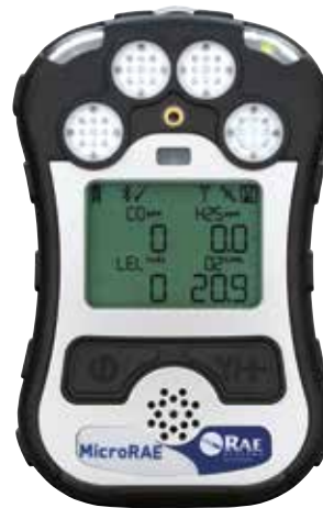
MicroRAE Gas Monitor (LEL, O 2 , CO, H 2 S)

CNX1-H1-Y-NA ConneX1 wireless single gas detector for hydrogen sulfide