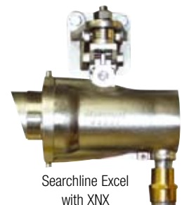
Searchline Excel with XXN